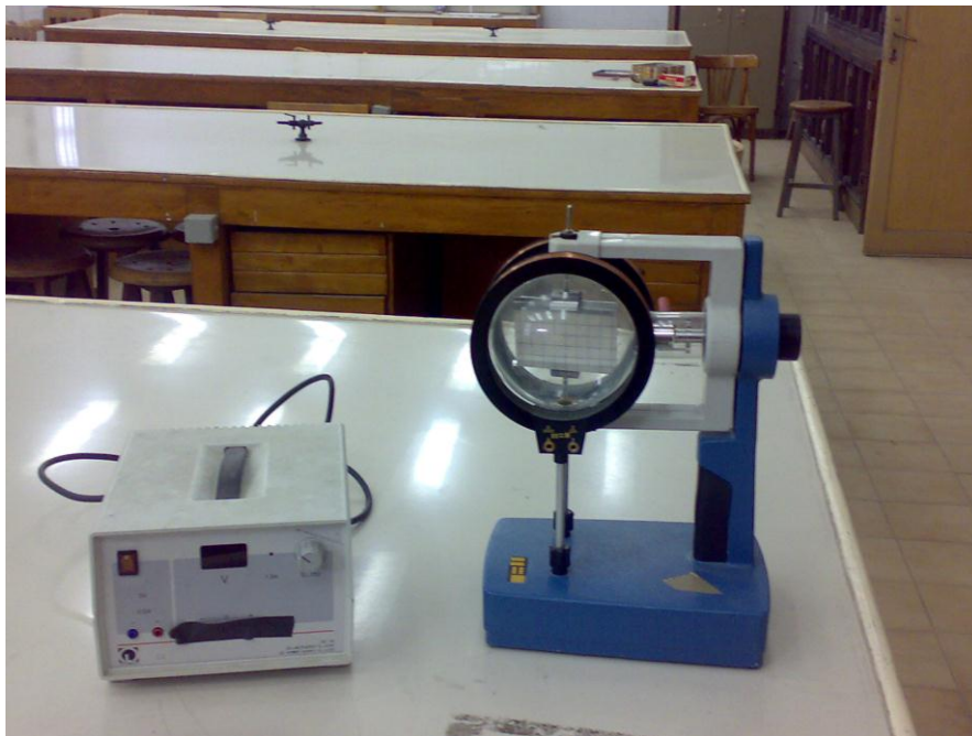
Determining the ratio of electron charge / electron mass