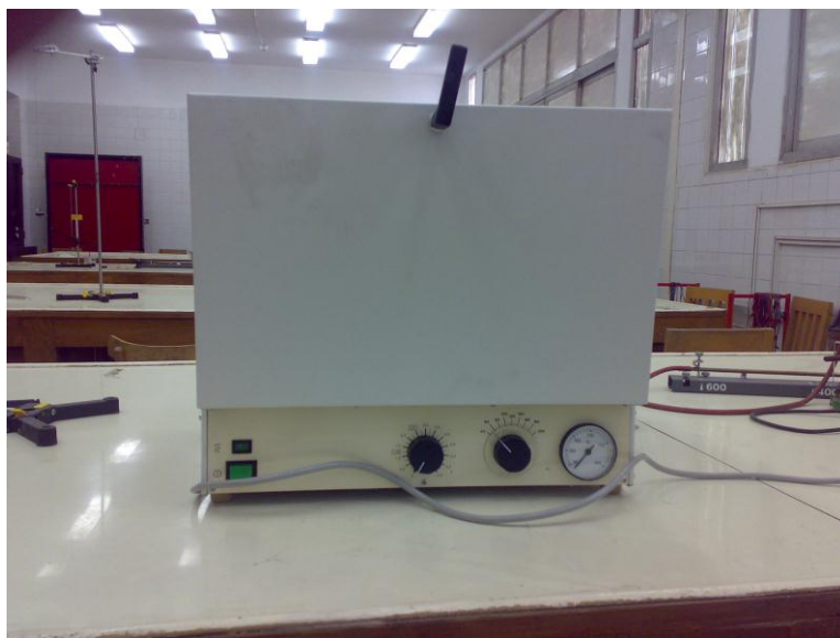
Electric furnace up to 250 C (Closed)