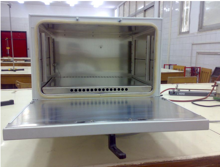
Electric furnace up to 250 C (open )