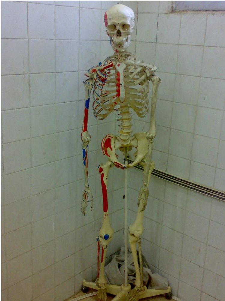
Skeleton of human body